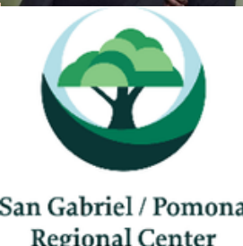
San Gabriel / Pomona Regional Center